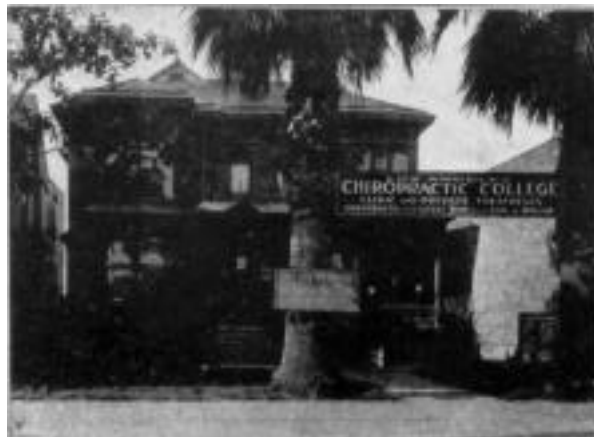
LACC campus, circa 1920? ; sign reads: "Los Angeles Chiropractic College; Clinic and Private Treatments; CHIROPRACTIC is the LATEST WORD in the CURE of DISEASE"