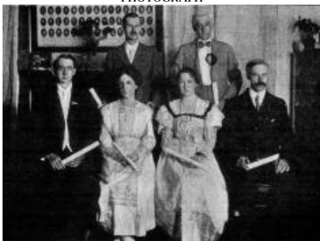
LACC Class of 1917

1917: LACC graduating class photo depicted in January, 1976 issue Chirogram (and LACC, 1921-22, 1922-23)