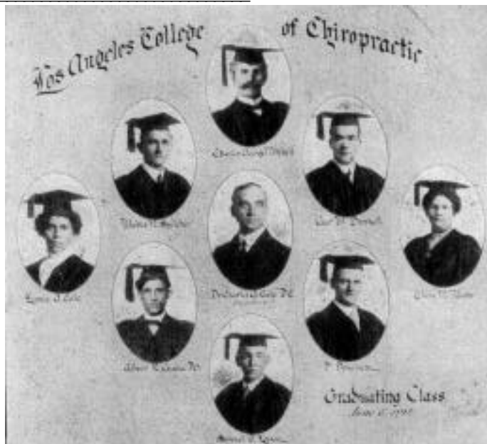
LACC graduating class of 1912