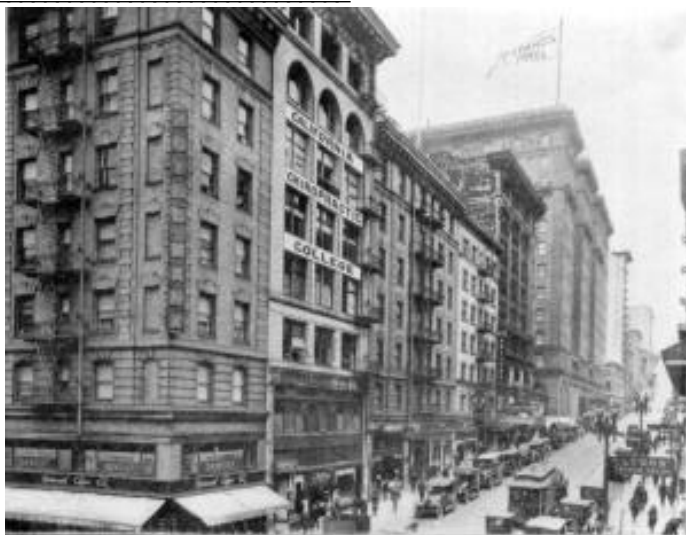
CCC-SF campus at 207 Powell Street

-(p. 9): ...the Medical Board of the State of California approved it as having the proper equipment, teaching capacity....since that time about sixty of the regular graduates of this College have been licensed by the State Medical Board of California as Drugless Physicians . We wish you to remember that this was the first and only drugless school approved by the Board among several in the State.