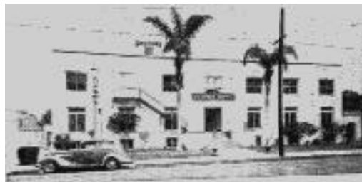
Doctor's Hospital at 325 West Jefferson Boulevard, Los Angeles (from the Scientific Chiropractor 1937 (Aug); 3(3):25)