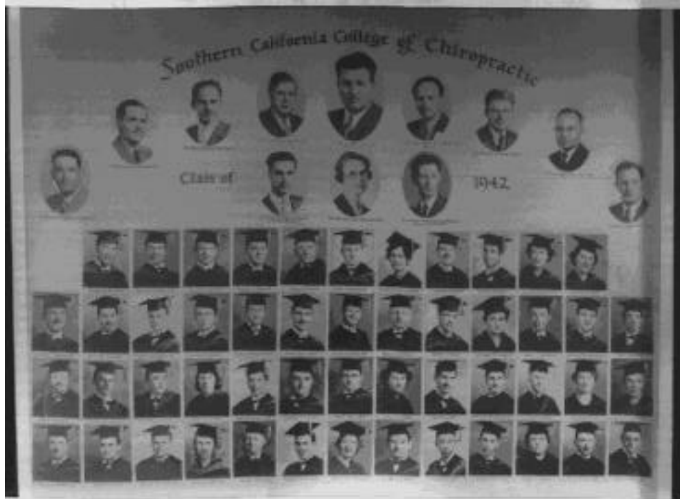
Faculty, administration and graduating class of the Southern California College of Chiropractic in 1942