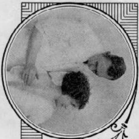
PALPAT Finding the Cause —One Imporia in Analj

There is no wealth great enough to compensate them for a life filled with poor health and suffering.