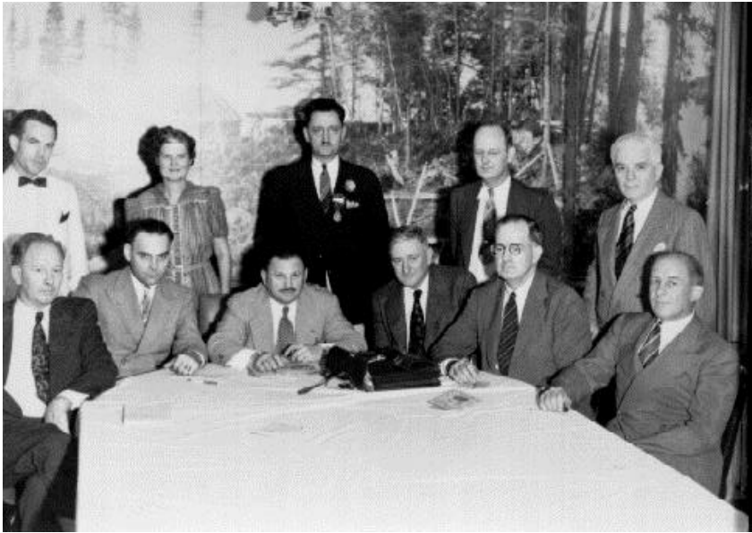
Meeting of NCA Board of Directors, Minneapolis, 1940