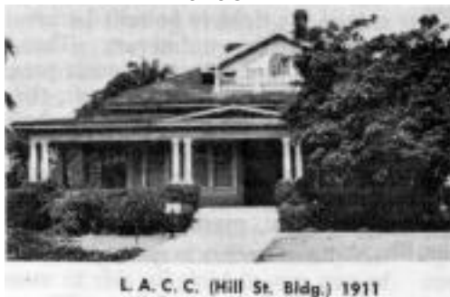
Chirogram 1969 (Nov); 36(11): 312

1911: according to the Chirogram [1969 (Nov); 36(11): 312]: Its earliest classes were conducted at Blanchard Hall, just off Broadway, in the heart of Los Angeles, California. As the course was lengthened and the enrollment increased, the college moved to larger quarters at 331 South Hill Street in the same city.