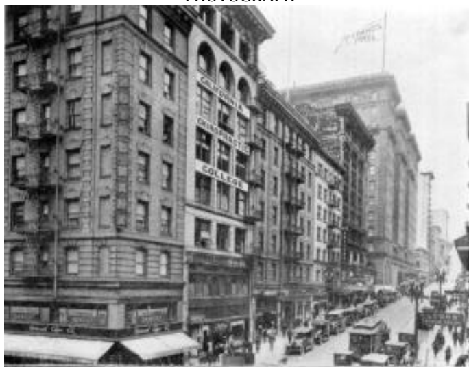
CCC-SF campus at 207 Powell Street

1918: Linnie A. Cale DC, DO listed as superintendent of Clinic in 1918 LACC class photo (SFCR Archives)