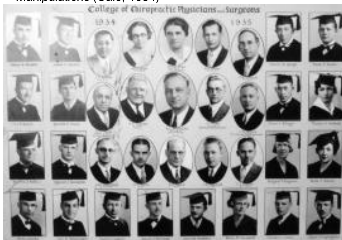
CCP&S graduating class, 1934-35