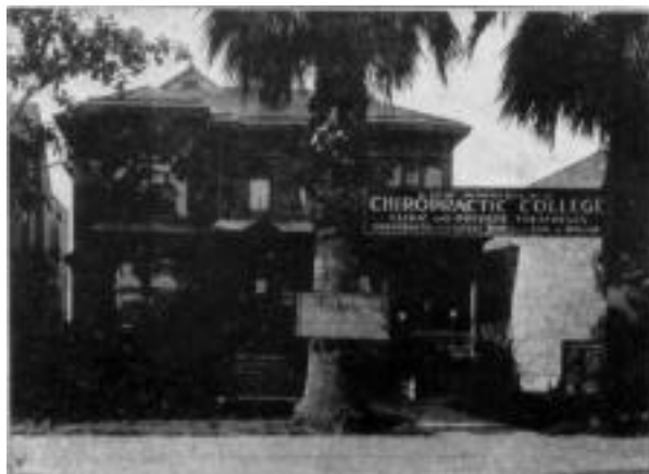
LACC campus, circa 1920?; sign reads: "Los Angeles Chiropractic College; Clinic and Private Treatments; CHIROPRACTIC is the LATEST WORD in the CURE of DISEASE"