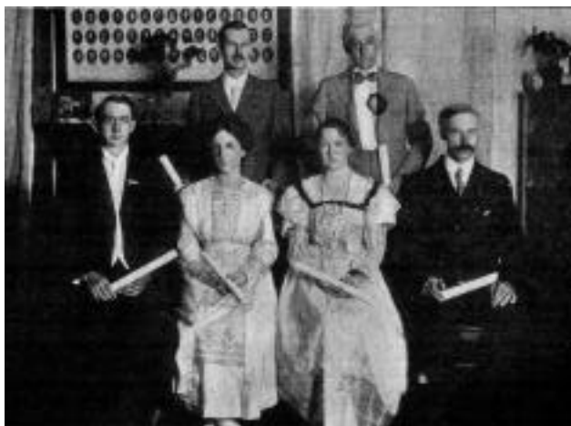
LACC Class of 1917

1917 (May 26) Fountain Head News [A.C. 22; 6(37): 6]: