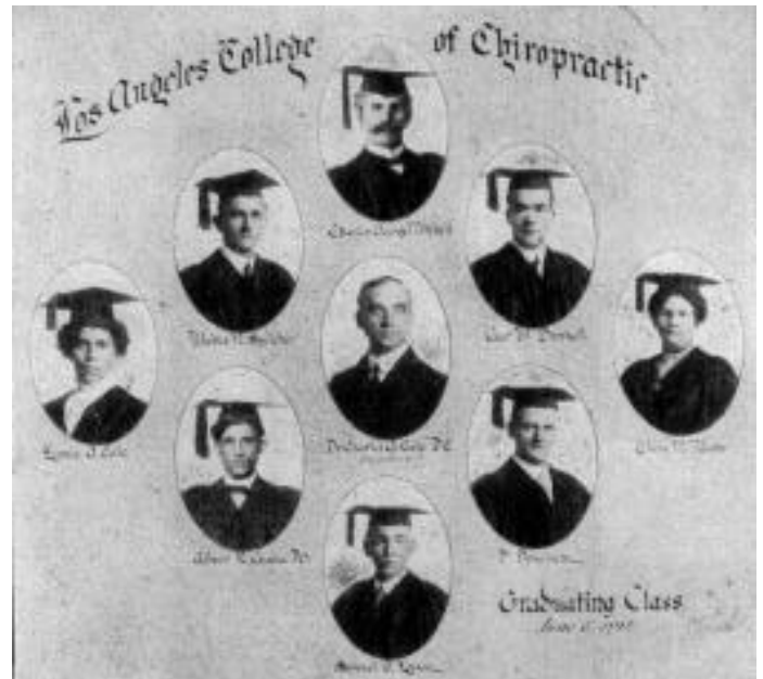
LACC graduating class of 1912