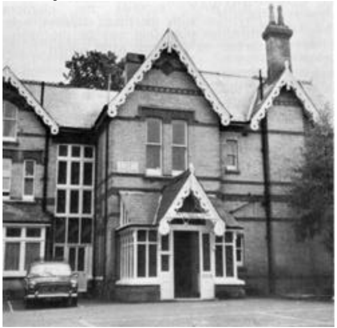
Administration and class rooms building – Anglo-European College of Chiropractic