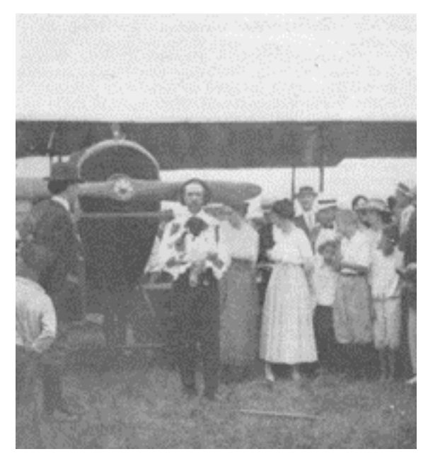
Sunday morning. Christening THE GOOD SHIP B.J.

Red & Magenta: questionable or uncertain information Green: for emphasis; Blue: not yet abstracted