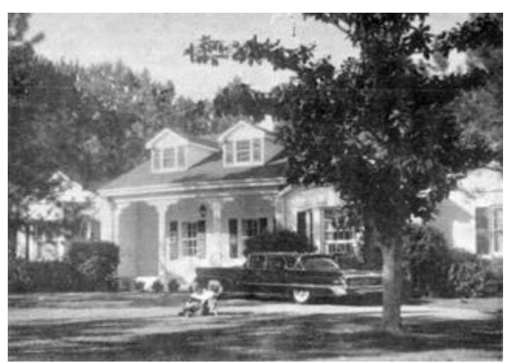
"Front view of the Harris Residence located on the outskirts at Albany on a half acre of land"