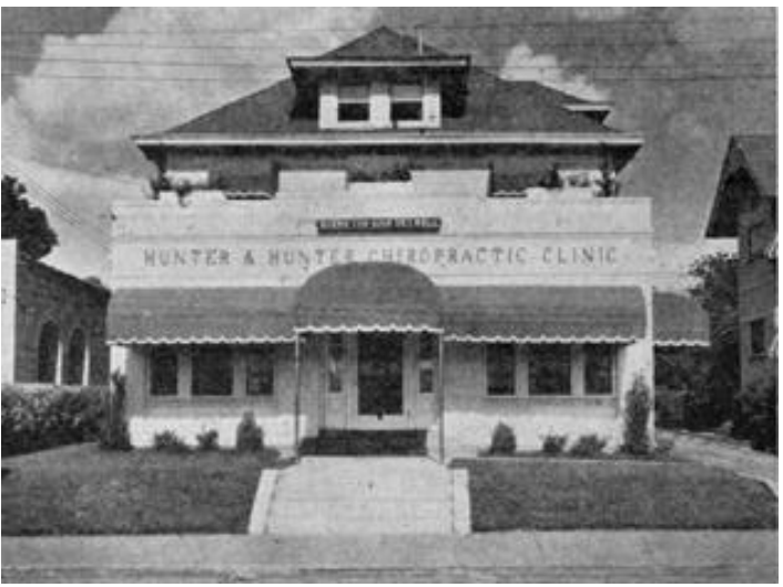
Hunter & Hunter Chiropractic Clinic in Springfield, Missouri, c1937