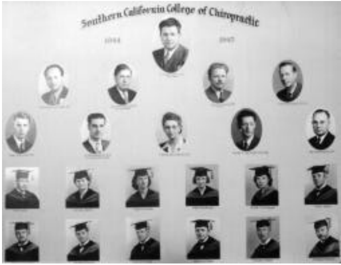
SCCC graduating class, 1944-45

before the Association will be in a position to consummate such