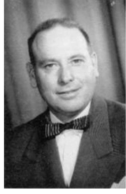
1958 (Jan): ICA International Review of Chiropractic [12(7)] includes:

-"Louisiana DCs react quickly to medical propaganda" (p. 19)